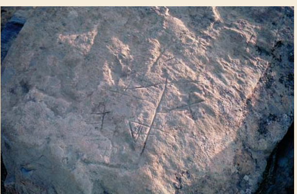
Grabado cercano a la presa.

Cercados de Araña is 9, nowadays a very prosperous area, where the land is ideal for growing fruit.